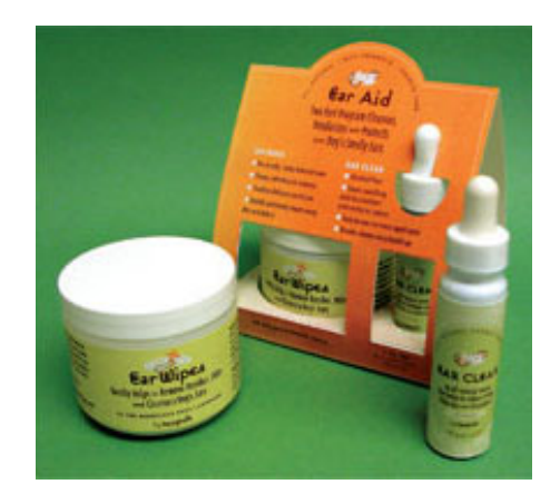
Ear Aid Combo Pack $28.00

A few drops of this antibacterial/antimicrobial formula will break down wax buildup that can often be a breeding ground for infections. Ear Clear contains arnica and chaparral oils to decrease the pain and discomfort caused by swelling. It also contains organic comfrey and calendula which soothes, heals and protects. Add a touch of essential oil of lavender to remove unpleasant odors and you have a complete solution for ear health.